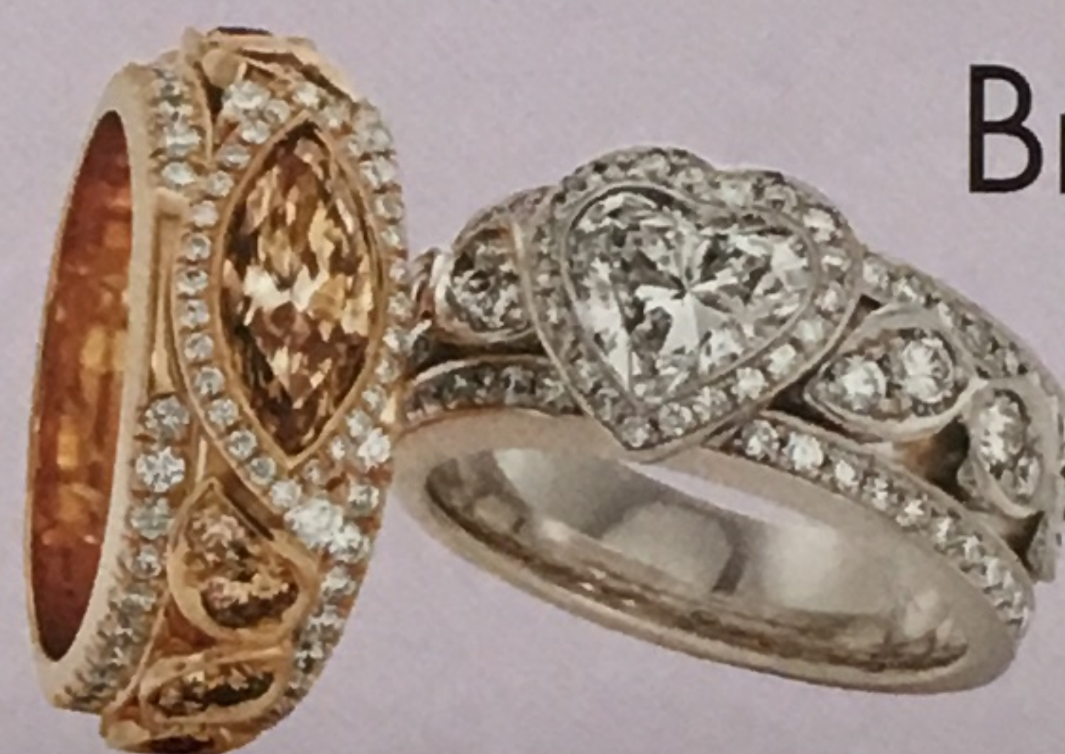
From left: Ring in 18-karat rose gold with a 1.03-carat natural champagne diamond centre stone and embellished with natural champagne coloured and colourless diamonds, and a ring in 18-karat white gold with a 1.24-carat heart-shaped diamond in D-colour with diamond accents by Hans D. Krieger Fine Jewellery

Hans D. Krieger Fine Jewellery is presenting a wide selection of fancy coloured diamond and coloured gemstone jewellery pieces at the Fine Design and Fine Gem Pavilion of the June Hong Kong Fair.