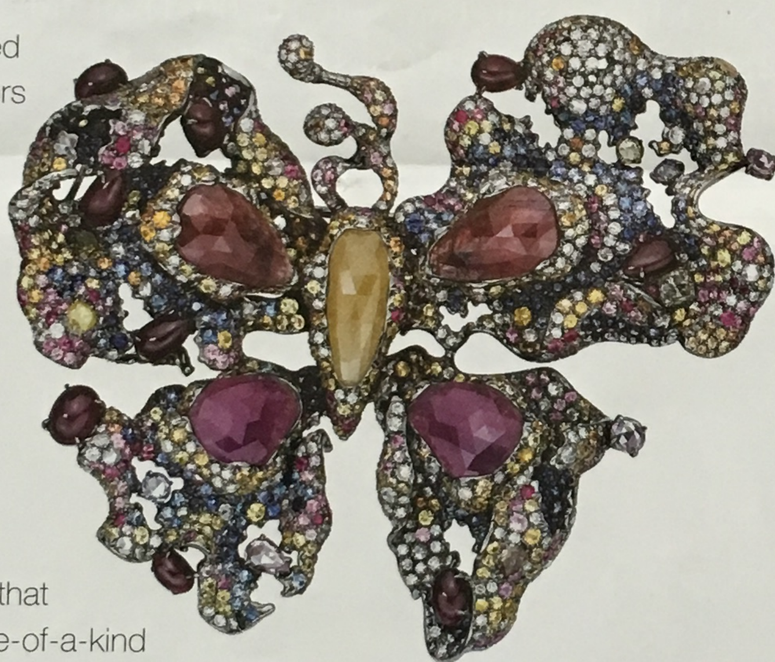
Bejewelled butterfly brooch in 18-karat gold by Bri-Star Jewellers Ltd