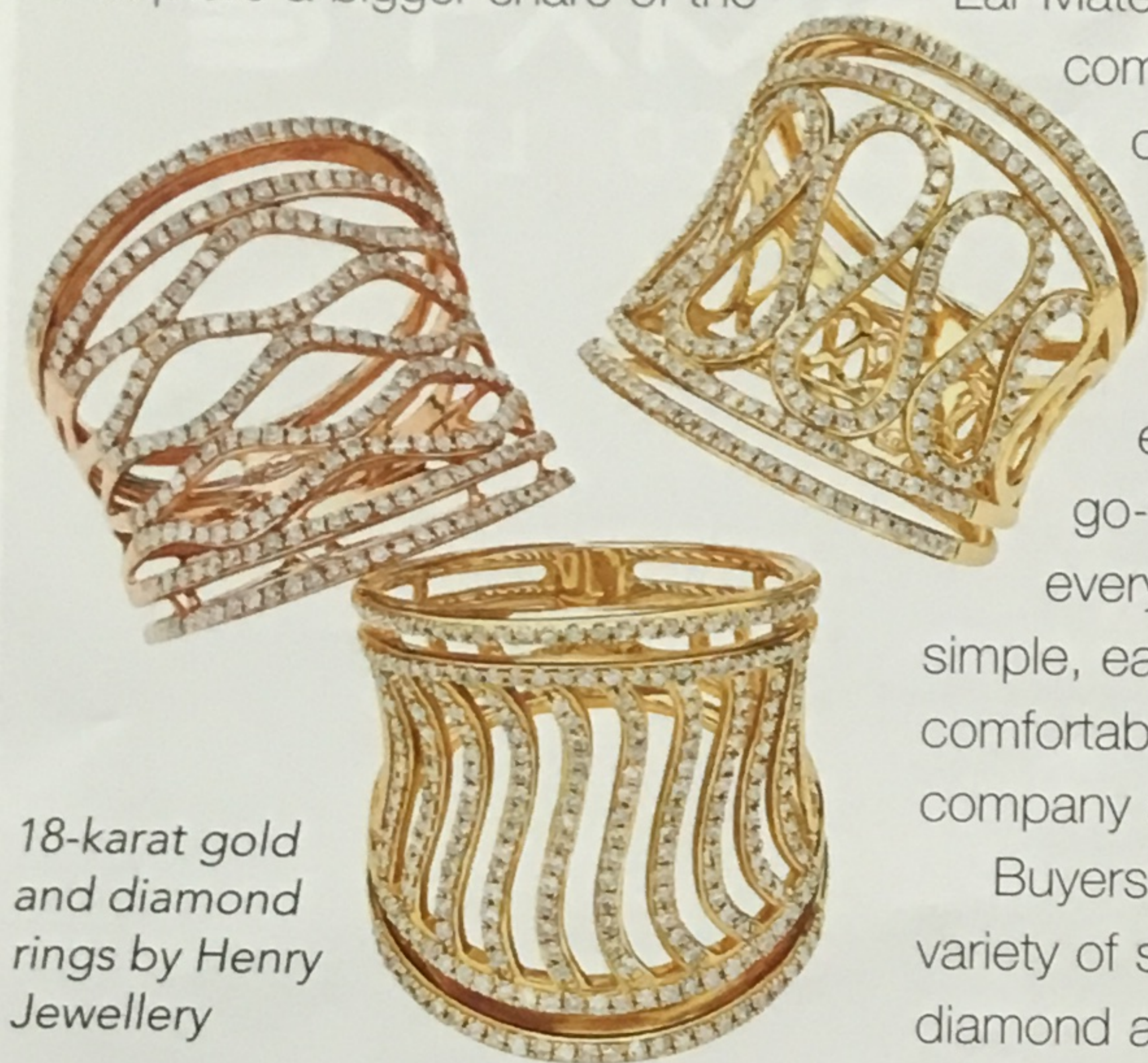
18-karat gold and diamond rings by Henry Jewellery

Henry Jewellery offers fine diamond, gem-set and pearl jewellery in 8- to 18-karat gold, platinum and silver.