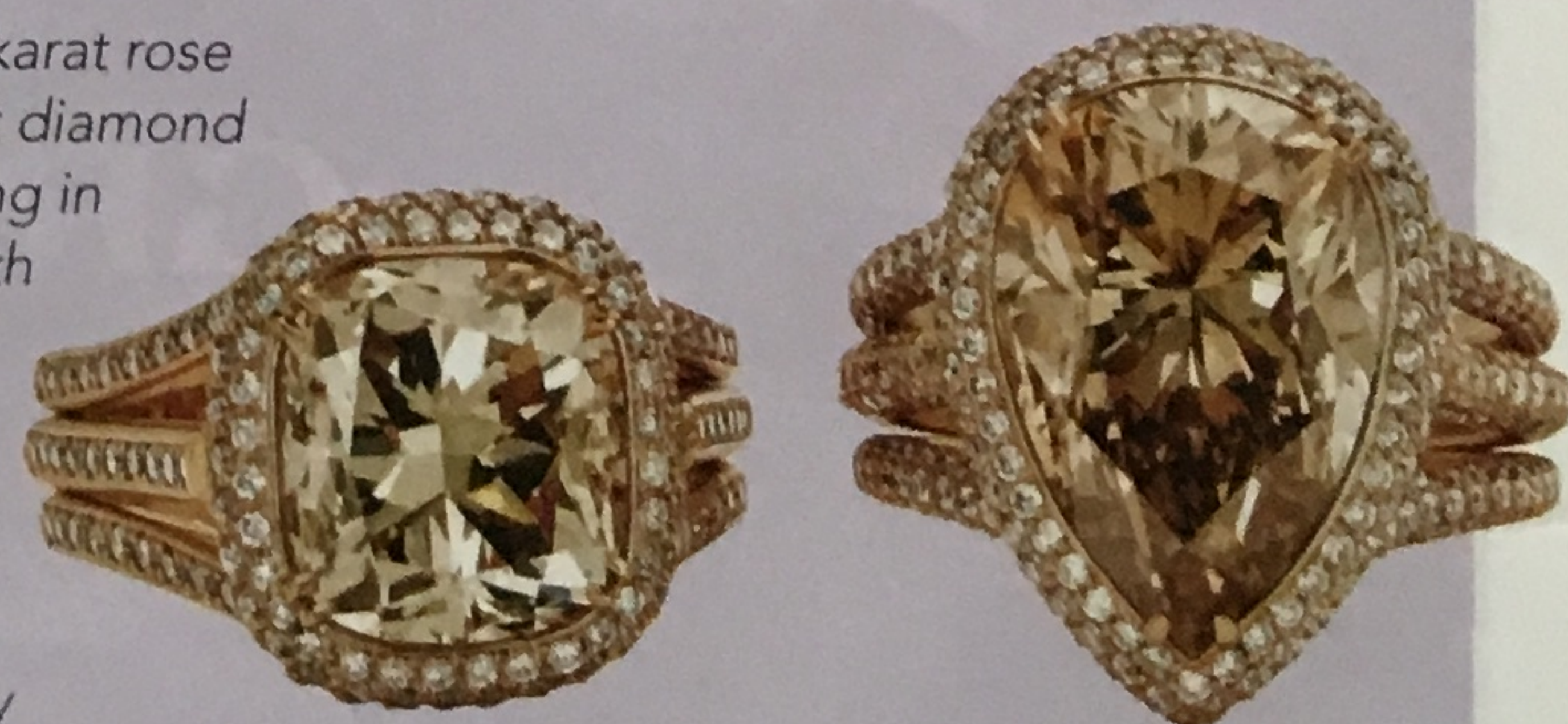
From left: Ring in 18-karat rose gold with a 5.98-carat diamond centre stone and a ring in 18-karat rose gold with a 7.84-carat fancy yellow-brown diamond with colourless diamond accents by Hans D. Krieger Fine Jewellery

At the June Hong Kong Fair, the luxury jeweller is highlighting a number of exceptional pieces including a ring in 18-karat rose gold with a 7.84-carat fancy yellow-brown diamond centre stone surrounded by colourless diamonds; a ring in 18-karat white gold with a 10.99-carat purple sapphire centre stone with diamond accents; and a pair of earclips in 18-karat white and yellow gold with two fancy yellow diamonds (total weight of 4.02 carats) and surrounded by fancy-shaped colourless diamonds.