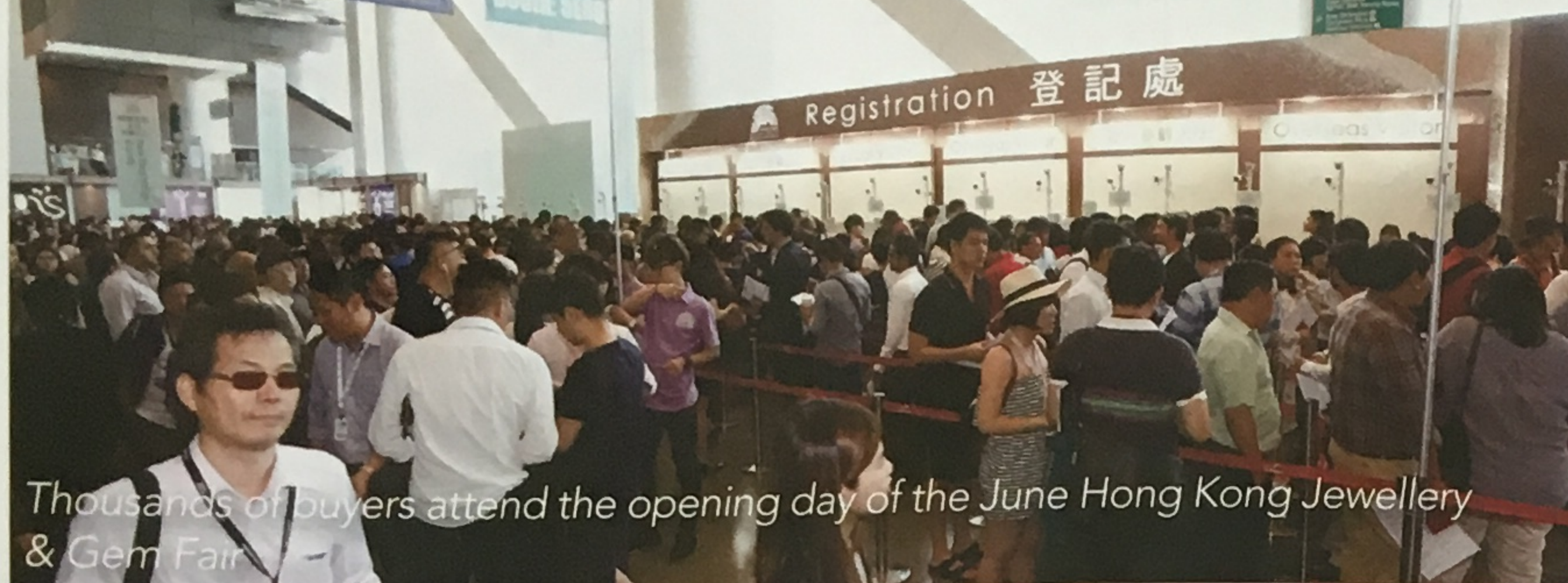
Thousands of buyers attend the opening day of the June Hong Kong Jewellery &amp; Gem Fair

The 29th June Hong Kong Jewellery & Gem Fair promises to meet every professional buyer's diamond, coloured gemstone and pearl needs as the four-day trade show opened yesterday at the Hong Kong Convention & Exhibition Centre.