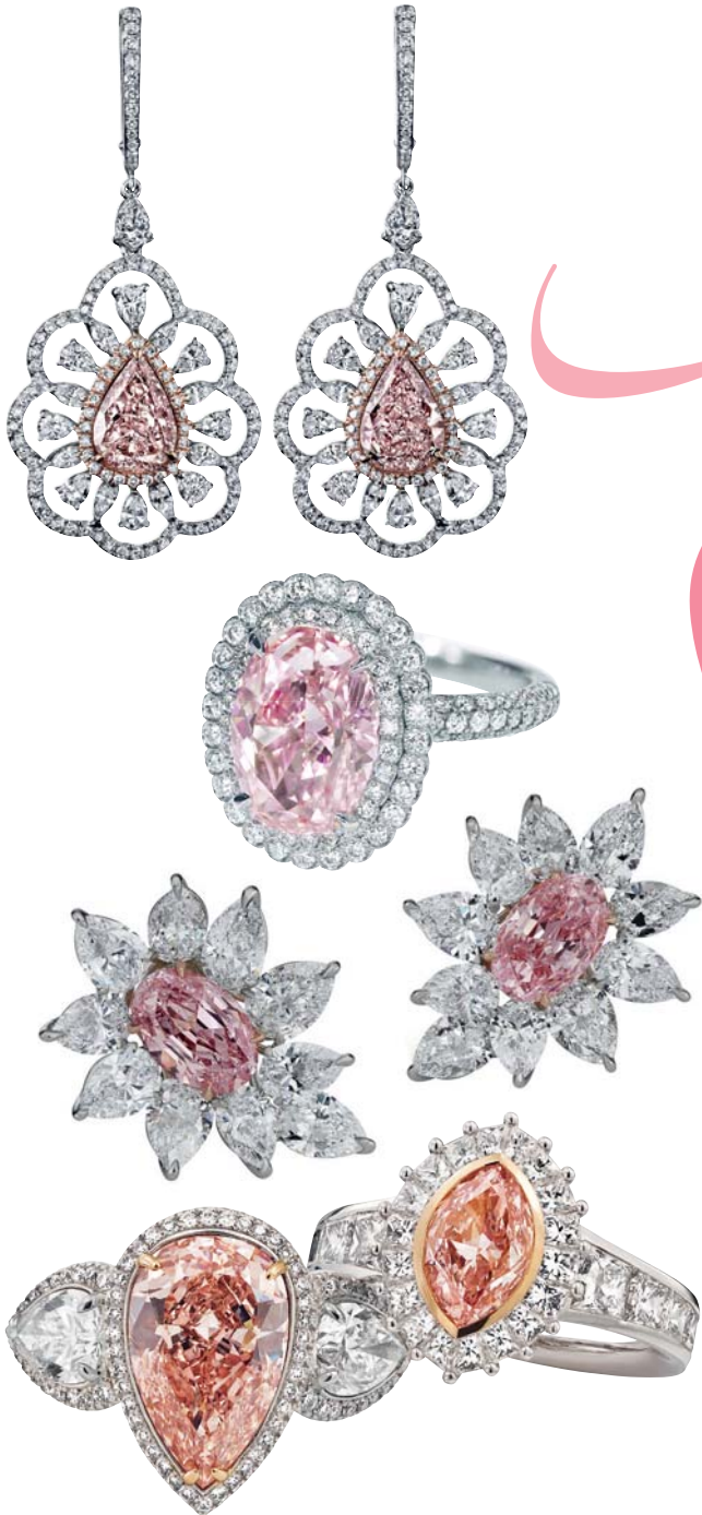
FROM TOP Pear shape pink diamond earrings, AVAKIAN

Underneath the soft and tender hue of pink diamonds lies a tenacious spirit